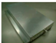
New GaN amplifier module