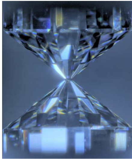
Fig. 1. Diamonds to squeeze a sample to ultrahigh pressures corresponding to those of the Earth's core (greater than 135 gigapascals). The samples are heated under pressure to high temperatures of the core (about 4000 kelvins and higher) by being irradiated by a laser through diamonds.